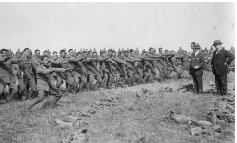
Pioneer Battalion performing a haka for ministers Massey and Ward, Bois-de-Warnimont, France, 30 June 1918. The inquiry into Māori military veterans' claims has begun.

This is because it would be unlawful for the Tribunal to inquire into claims that are settled by legislation, and unnecessary for it to hear claimants on the same matter twice. Some health issues, for example, have already