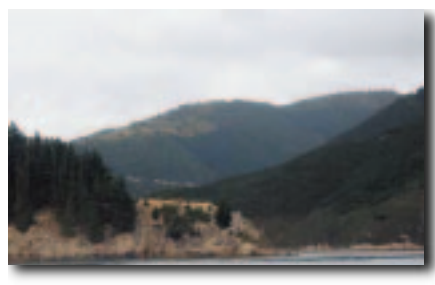
Pā site in Queen Charlotte Sound

Te Atiawa raised the issue of environmental damage to their traditional fishing grounds and wāhi tapu, and