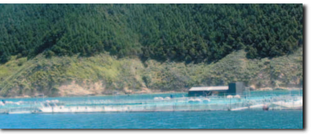
Salmon farming in Queen Charlotte Sound

The Report will be available from Legislation Direct in late-March 2003, and available on the Tribunal's passworded extranet accessible through inquiries: www.waitangi-tribunal.govt.nz/