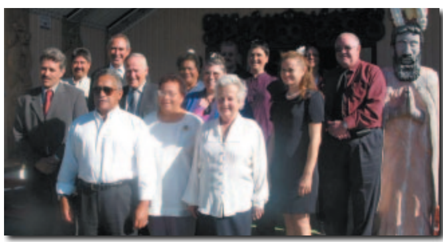
Tribunal members and the claims committee at Waikawa marae

Atiawa allege the Crown was negligent in allowing this to happen, and for failing to protect Māori interests.