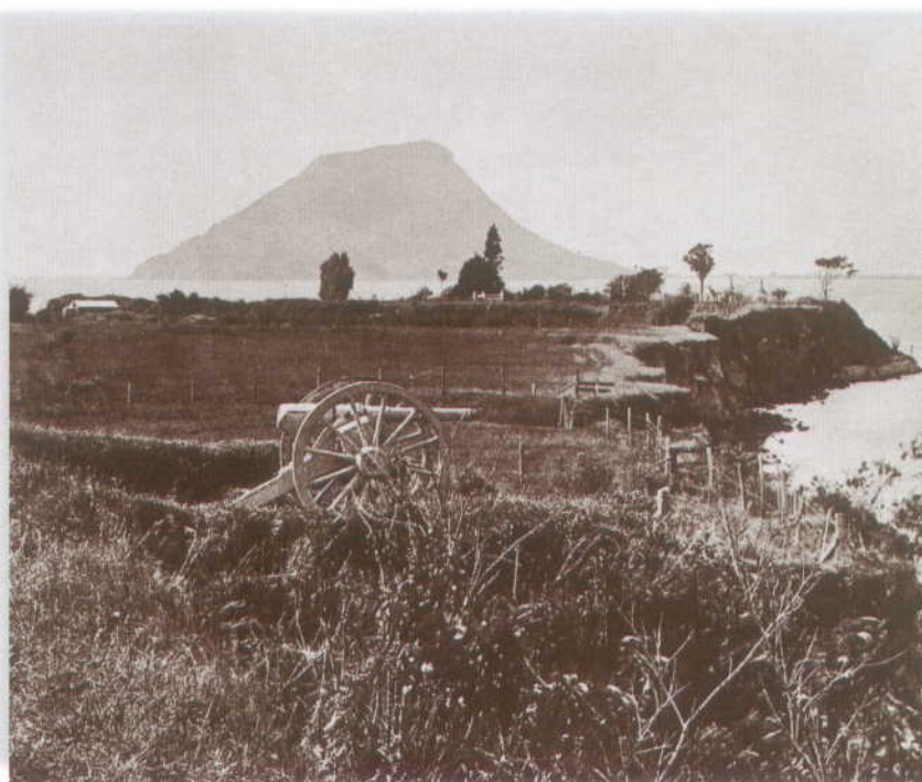
Tauranga: view from Monmouth Redoubt toward Manao (Mount Maunganui). Mission House centre and military settlement on right. c.1880.