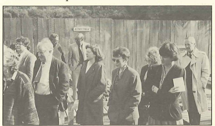
Tribunal, Crown and claimants at Ngawha Springs

The claimants now possess one acre of the original 5097-acre Parahirahi Block which contains a portion of the Ngawha geothermal springs. They claim that the Crown did not acquire ownership of the geothermal resource in its acquisition of the land.