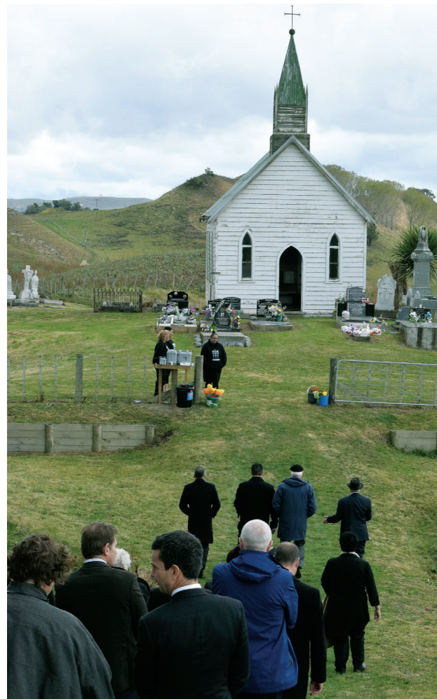
The Taihape Tribunal makes a site visit to Opaea Church and urupā, north of Taihape, during the sixth hearing of its district inquiry, held in April 2018.

The district inquiries that have been progressed since 2014 have made slower but steady progress. Between them, they account for more than a third of all registered claims. The kaupapa inquiry programme has